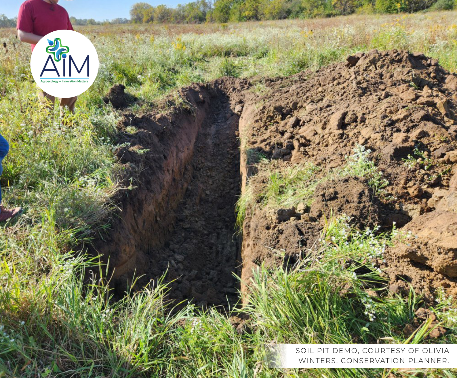
SOIL PIT DEMO, COURTESY OF OLIVIA WINTERS, CONSERVATION PLANNER.